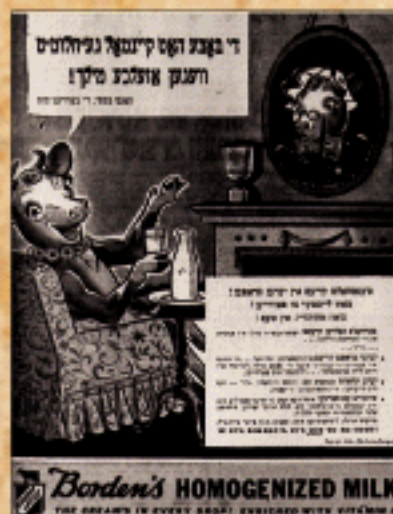
Borden Milk-Elsie the cow says "The Buba (grandmother) never dreamed of such milk!" Morning Journal Sept 16, 1941.