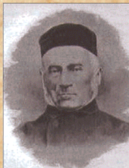
Rabbi Julius Eckman, Rabbi of Temple Emanu El, San Francisco, CA, circa 1856.

Timeline Of American History 1850-1860 With Notable Examples Of Defenders Of The Public Trust