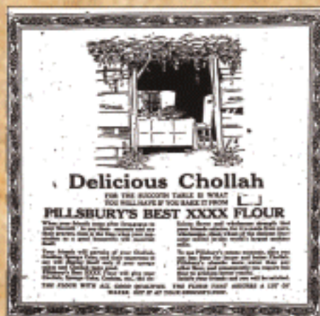
Pillsbury Flour for Sukkos. Hebrew Standard, October 10, 1919.